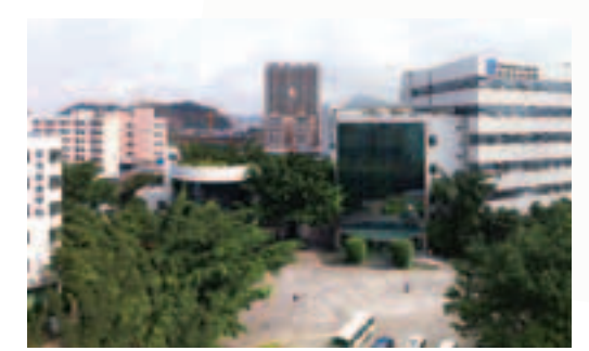
深圳分公司於1987年成立 Shenzhen office established in 1987