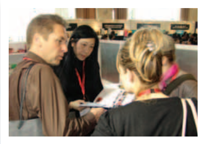
與客人熱烈討論 In discussion of business opportunities with guests