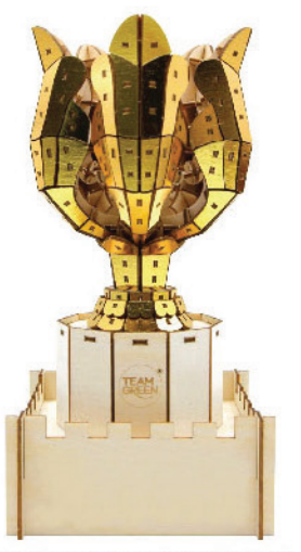
諾貝爾英雄活動指定 JIGZLE®金紫荊為大會紀念品。 The JIGZLE® Golden Bauhinia - the official souvenir of Nobel Heroes.