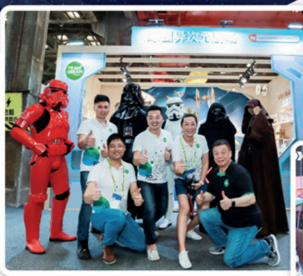
團隊得到星球大戰cosplayer的支持! Our team gained support from Star War fans!