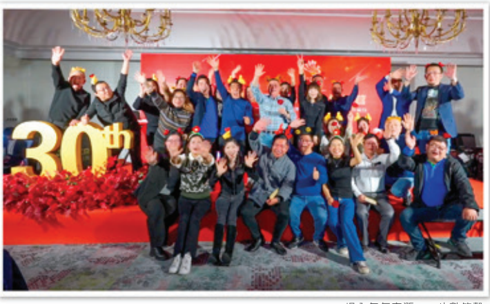
場內氣氛高漲,一片歡笑聲 The participants enjoying themselves